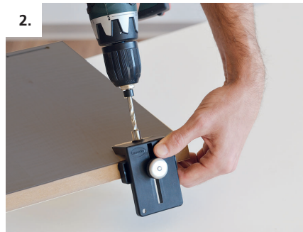
2. Drill 6mm access hole in bottom of tread for male Clamex connector, using drill jig