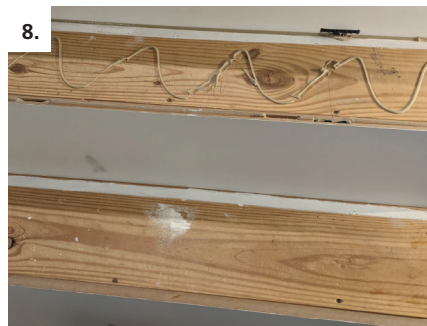
8. Install Tenso connectors and apply PL adhesive to rough framing and underside of tread