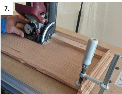
7. Use same reference block for slot location on underside of tread