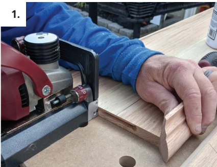
1. Make 14mm P-System slot in edge of tread and bullnose return