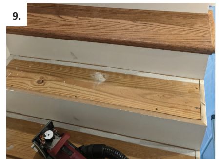
9. Tread is glued securely with no visible fasteners