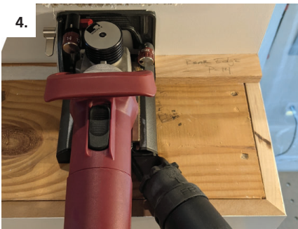
4. Create stop block to reference P-System slot in riser