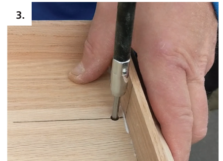
3. Glue and assemble nosing to tread with Clamex P-14 by engaging cam lock