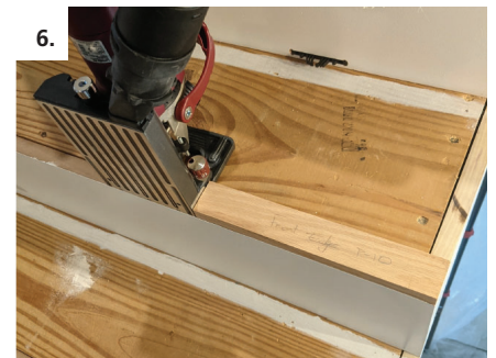
6. Create reference block for slot location on top edge of riser