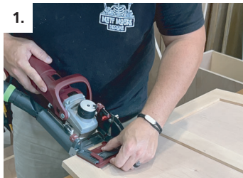
1. Lay out and machine P-System slots for top edge of front panel