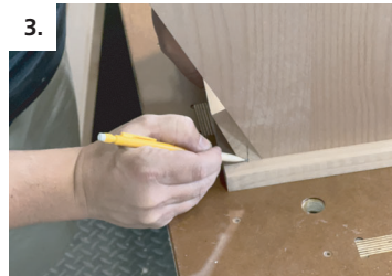
3. Transfer center line of slots to upper unit