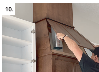
10. Slide top of access panel into place