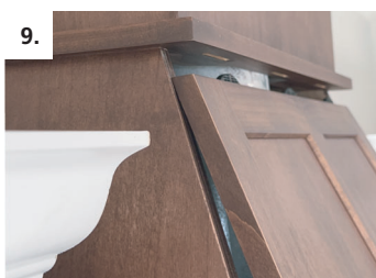
9. Use Bisco connectors at top edge for alignment and positioning