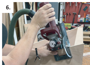
6. Machine slots in edge of hood frame uprights