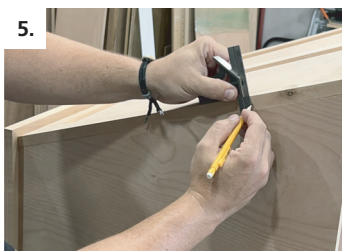
5. Lay out location for Clamex P-14 slots