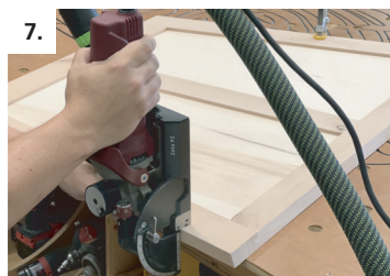
7. Machine slots on back side of front access panel