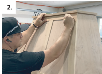
2. Transfer marks from front access panel to upper unit