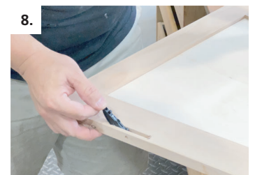
8. Install Clamex connectors; male half on the access panel