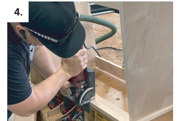
4. Machine P-System slots in upper unit