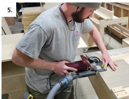
5. Use Zeta P2 to machine the P-System slots for the female halves