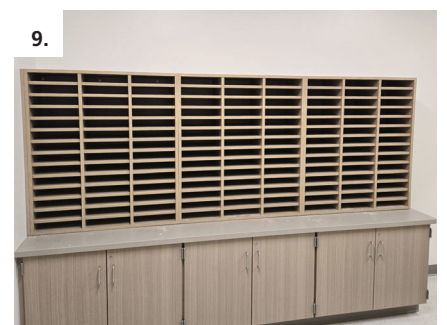
9. Sliding, locking, clamping connections for shelves and uprights!