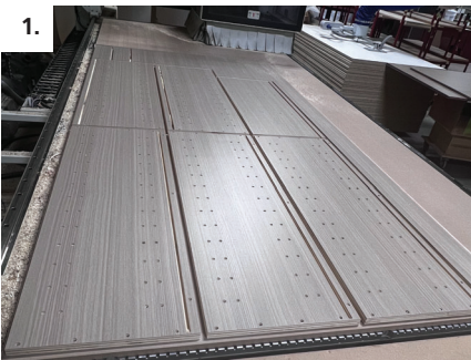
1. Drill 8mm holes for male halves into uprights with CNC router (or handheld jig)