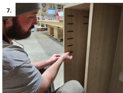
7. Install male halves into cabinet uprights