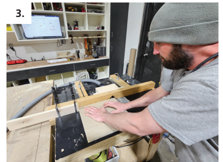
3. Machine the running slots on shelf edges with wing cutter on router/shaper table. Use stop blocks on fence to keep slots blind within shelf edges.