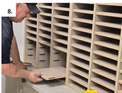
8. Install shelves into cabinets