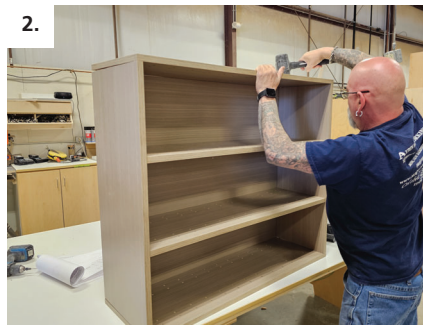
2. Pre-assemble cabinet units