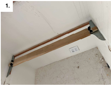
Establish control line for front edge; then scribe left, right and back edges of shelf