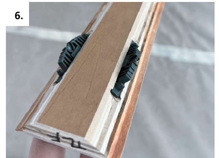
Install Tenso male halves in fascia edges. Use pre-load clips