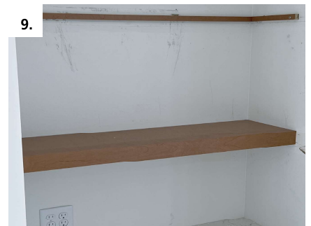
No visible connectors on beveled edges