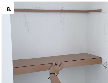
Apply glue, snap fascia to bottom first, then hinge together to snap top to fascia