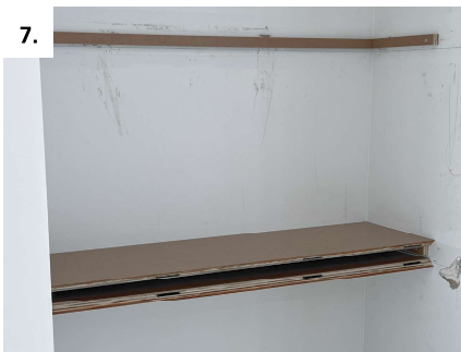
Install top on cleats with gravity; bottom headless-pinned at back edge