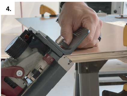
Machine slots, referencing finished side with stop square