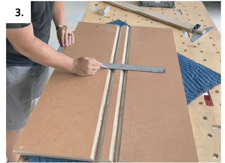
Lay out center lines for connector slots