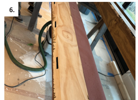
6. Install connectors