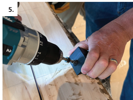
5. Using drill jig, drill 6mm wrench access hole for Clamex connectors (not required with Tenso)