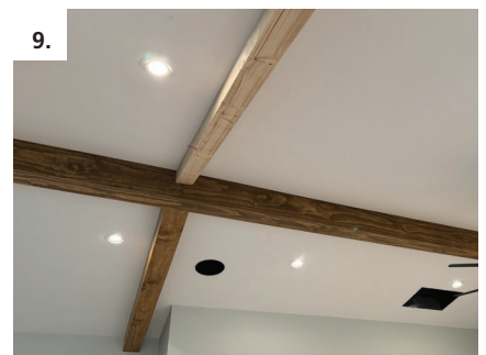
9. Scribe to ceiling and install