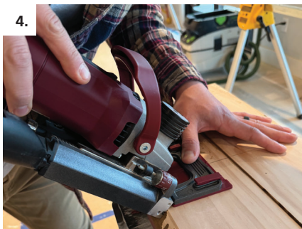
4. Machine P-System Slots