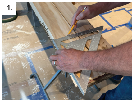
1. Lay out center lines for connectors on facias and soffit