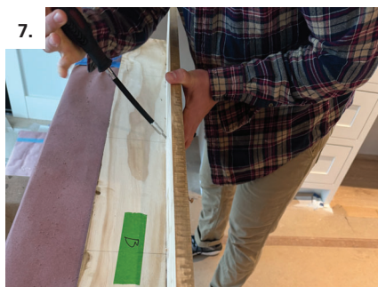
7. Assemble and clamp Clamex connectors with allen wrench tool