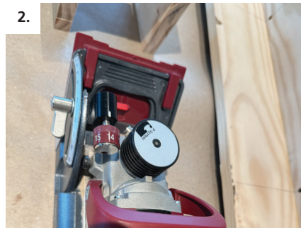
2. Set Zeta P2 to "14" for the P-14 connectors