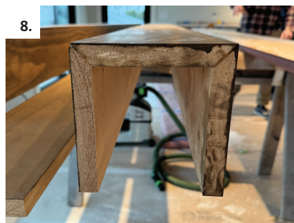
8. Pre-assemble as complete "U"- or partial "L"- shapes