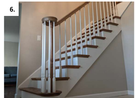
6. Crisp seams with no visible fasteners