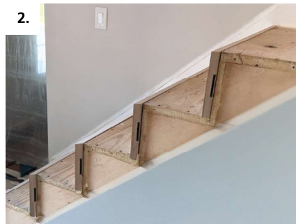
2. Install Tenso female connectors on beveled edge of risers