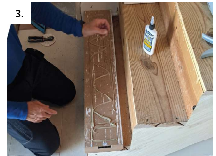
3. Install Tenso male connectors in beveled edge of stringer