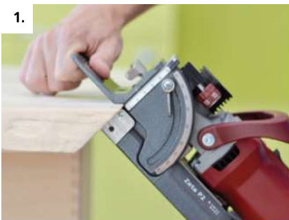
1. Make P-System slots in stringer and risers using stop square