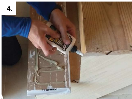
4. Glue beveled edges of finished stair parts and apply adhesive to backside of riser