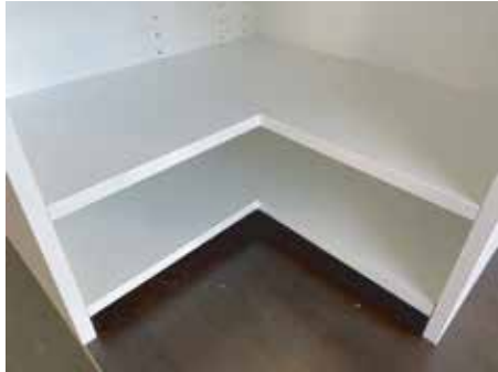
Consistency in product quality: Zero edge-banding material on separate components