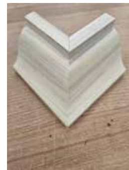
Secure, invisible glue-clamped connection on-site