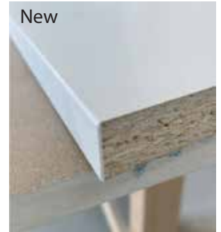
No glue line & soft edge