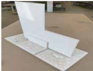
Labor Savings: Eliminates edge-banding and trimming by hand