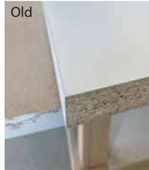
Visible glue line