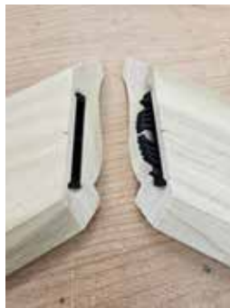
Easy machining with Zeta P2